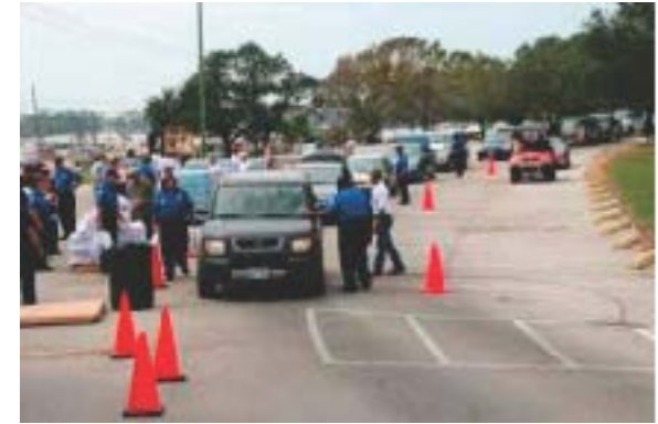
Water and Ice Commodities