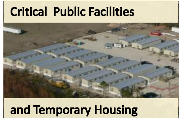
Critical Public Facilities