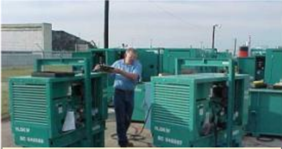
Temporary Emergency Power