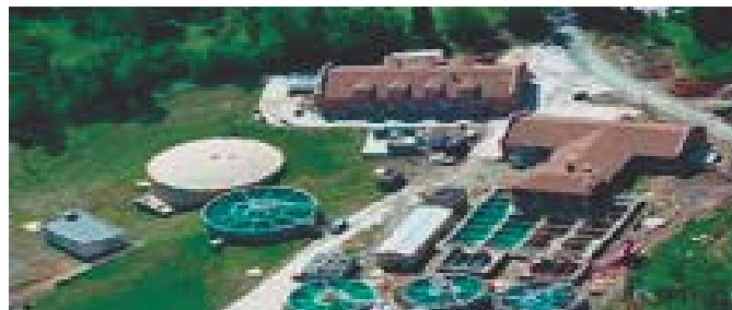
Sub-Taskings To Other Agencies