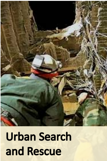
Urban Search and Rescue